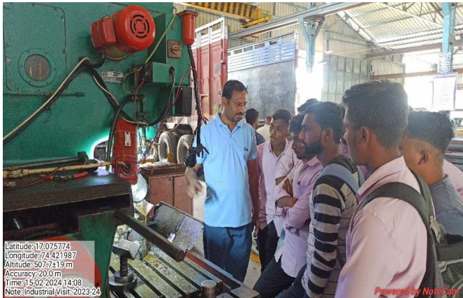
Supervisor explaining working of machinery at Pandurang engineering works.